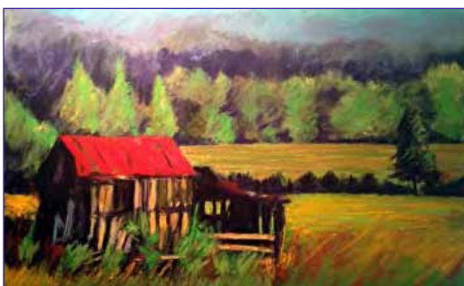
"One More Summer" by Beverly Kies