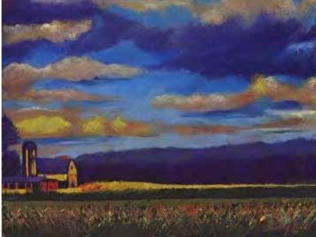
"Dusk At Mills River" by Beverly Kies