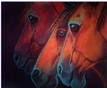
"Companionship" by Beverly Kies