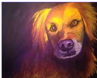
"Golden" by Beverly Kies